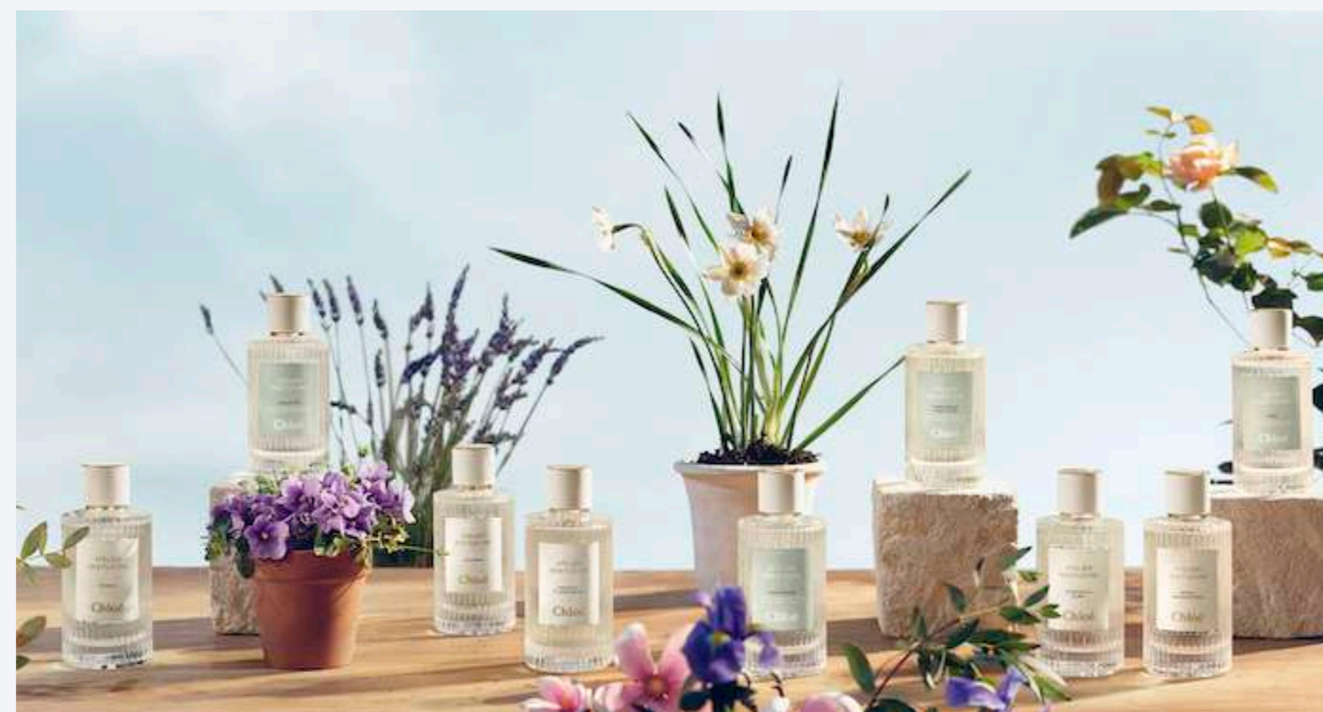
See the latest from Chloe, Puma and more

Follow us on Facebook and join our Telegram channel for the latest updates.